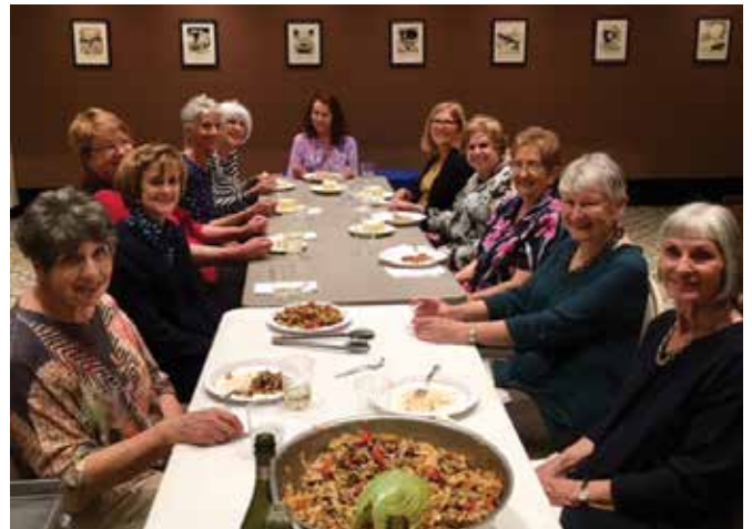
LACP Card Party, 2018

There will be no monthly meetings held from July-September. We look forward to resuming our meetings on Oct. 3 at our fall luncheon at the Stockton Golf & Country Club.