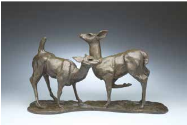
Diana Reuter-Twining, Hush , bronze on wood base, 9" x 18" x 9"