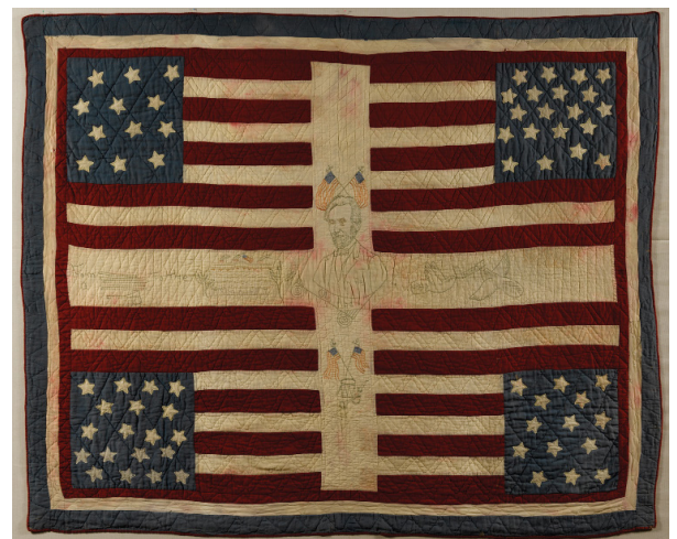
Right: Lucy Frost (Dubuque, IA), Abraham Lincoln Flag Quilt , c. 1886, Cotton with cotton applique and embroidery, Image Courtesy of the American Folk Art Museum, Gift of Florence W. and Joe P. Rhinehart, Photo by Gavin Ashworth