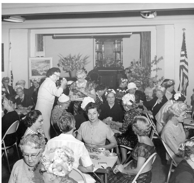
LACP's card party, c. 1950s

On June 7 we will enjoy a boxed lunch general meeting at 12 p.m. This meeting will close our season until we resume in October.