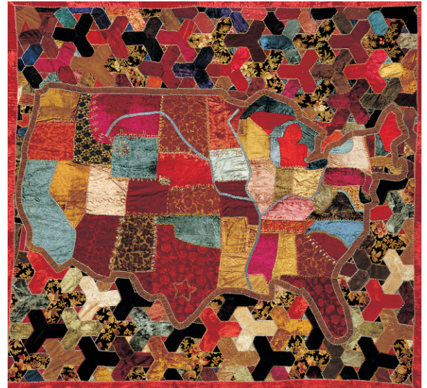
Above: Artist Unknown (Virginia), Map Quilt , 1886, Silk and cotton velvets and brocade with embroidery, Image Courtesy of the American Folk Art Museum, Gift of Dr. and Mrs. C. David McLaughlin, Photo by Schecter Lee

There is something alchemical about a quilt. Ordinary materials are transformed into something wholly extraordinary that, piece by piece, block by block, embodies profound creativity and vision. What can be gleaned from a bit of patchwork cut from a wedding dress, a castoff feed sack, or commemorative flag? How are personal, political, cultural, and spiritual ideals inscribed onto a quilt's surface? In the same way that a map is a pocket-sized abstraction of the world beyond what can be seen, a quilt-maker's choice of fabric and design reveals insights into the topography of their world and their place within it. By uniting diverse (and emblematic) materials, quilts allow us to reconstruct a deeply personal outlook on the world, balancing creativity and tradition, individuality and collective zeitgeist.