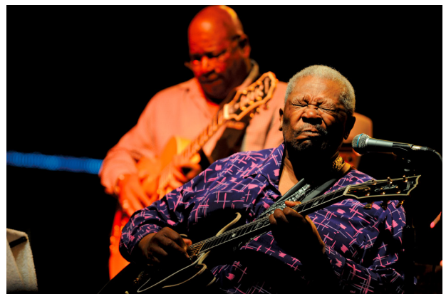
Image captions (top; left to right): Bo Diddley cast, TBD, resin, 9" x 7 1/4" x 7"; Bobby Rush cast, TBD, resin, 10" x 7 3/4" x 7 5/8"; Koko Taylor cast, TBD, resin, 9 1/4" x 7 1/4" x 7". (above; top to bottom): Hopson Commissary, Clarksdale, MS, October 5, 2007, archival ink jet print, 20" x 24"; B.B. King at his Homecoming Festival, Fletcher Park, Indianola, MS, January 27, 2010, archival ink jet print, 20" x 24".