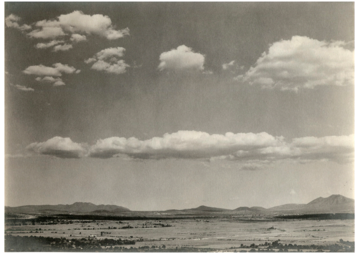
Image Captions: (above) Edward Weston, From the Summit of the Pyramid of the Sun (Valley of San Juan) 1923, Matte-surface gelatin silver print, 6 3/4" x 9 1/4"; (left) Edward Weston, Rosa Covarrubias, 1926, Gelatin silver print, 9" x 6 3/4"

Mexico City in the 1920s-30s was the scene of one of the great artistic flowerings of the twentieth century. Like Paris in the aftermath of World War I, Mexico City after the decade-long Mexican Revolution served as a magnet for international artists and photographers. Foremost among the expatriate photographers was the Los Angelino, Edward Weston, who embedded himself in the artistic milieu surrounding the muralist painters Rivera, Orozco, and Siqueiros. Weston reinvented his approach to picture-making during his three years in Mexico, 1923-26. The soft-focus painterliness that had characterized his studio portraiture in the 'teens melted away under the brilliant Mexican sun, to be replaced by crystalline landscapes as well as evocative still lifes that prefigured his later shells and peppers.