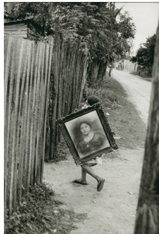
Image Captions: (right) Henri Cartier-Bresson, Mexico (young boy carrying painting) 1963, Ferrotyped gelatin silver print, 9 3/4" x 6 1/2"; (below) Tina Modotti, Experiment in Related Form (Glasses), 1924, Gelatin silver print, 7 3/8" x 9 3/8"