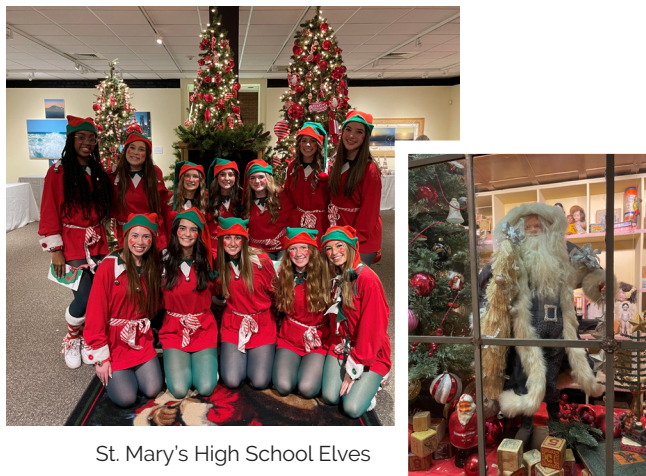
St. Mary's High School Elves

JWG hosted their Family Christmas Party on December 2, and guests to the museum were delighted to see the festive holiday decorations and, of course, Santa and his elves! Thank you to all who volunteered for decorating, setup, and day-of event. Thank you Junior Women's Group for bringing the holiday cheer to the museum during this joyous season!