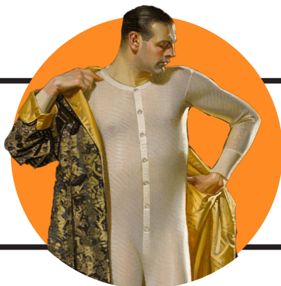
Image caption: (top to bottom, left to right) "Bobbing for Apples," Oil on canvas, 1913; "Man in Long Underwear," Oil on canvas, c. 1911; "U.S. Marines Enlistment Poster," Chromolithographic print, 1918; "Kellogg's Kid, Girl About 12," Oil on canvas, c. 1912-17

This year marks the 150th anniversary of J. C. Leyendecker's birth. The Haggin is celebrating this milestone all year long with a special exhibition of his work, exciting events, fun giveaways, and more! Join us in celebrating one of the most talented artists of the Golden Age of American Illustration.