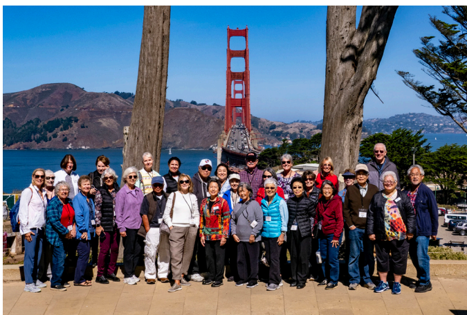
Image caption: DMT group at the Tunnel Tops & More tour, San Francisco, 2023

How can I contact you? We have an email address, HagginTravel@gmail.com. Please send us your inquiries, suggestions and comments! We also use this email account to communicate with our travelers regarding registration and trip logistics.